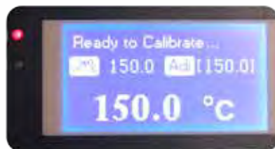
User temperature calibration