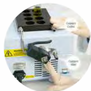
Cooling System Connection Port